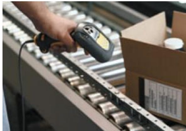
Barcodes leading Towards Lean Manufacturing using Finsys ERP